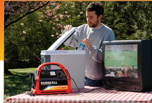
Portable power anywhere